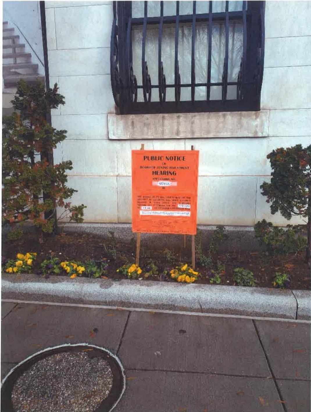
Figure 1 – Massachusetts Avenue, NW (Dupont Circle) - December 30, 2019