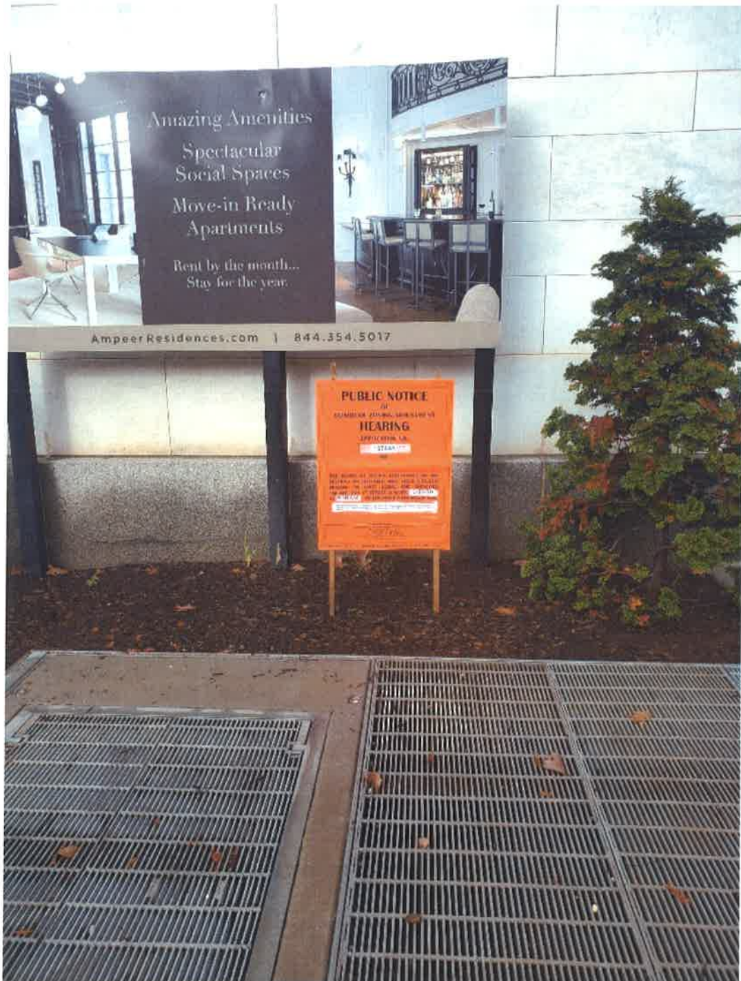
Figure 2 - P Street, NW - December 30, 2019